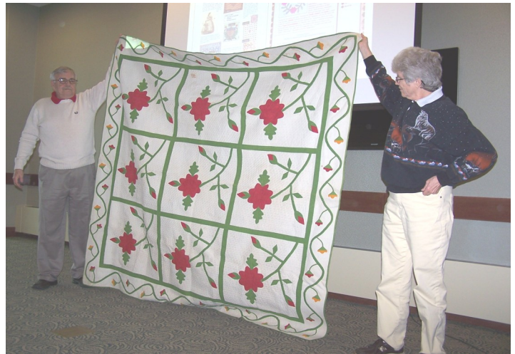
A quilt shown at our January meeting