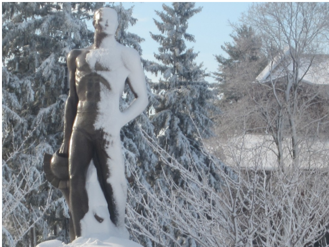
“Hey Florida Group of MSURA, don’t you miss East Lansing in January?”