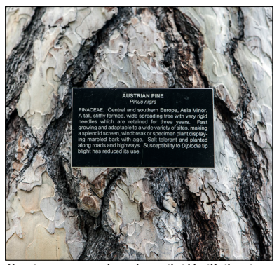
Many trees on campus have plaques that identify them to interested passersby.