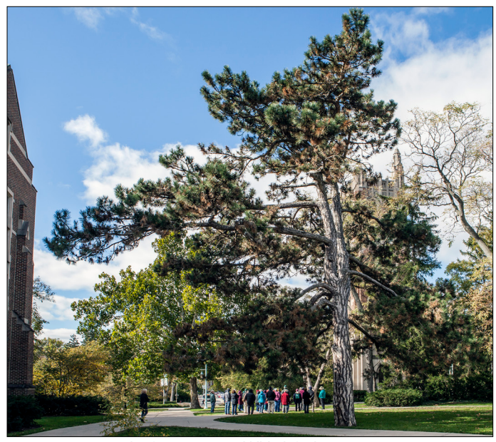
A campus tree towers over the MSURA group on a cool fall day in October.

At the end of the tour, it was clear that Telewski had not only extensive knowledge about the trees of MSU, but also a passion for preserving them.