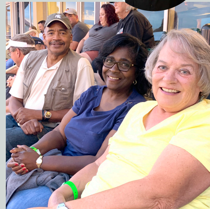
MSURA hosts Lugnuts outings every summer.