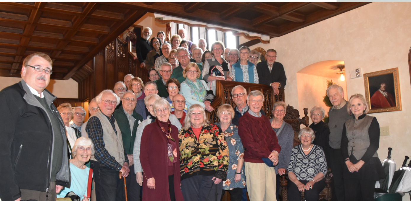
MSURA members enjoyed a tour of the Kellogg Manor and lunch. The day trip included a visit to the Gilmore Car Museum as well.