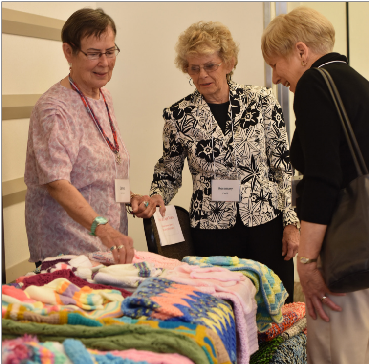
Members of the knitting club displayed some of their work at the luncheon. This popular special interest group has about 30 members, and they meet bimonthly in the Nisbet building. They donate the knitted items to a variety of charities, including St. Jude and a South Dakota reservation.