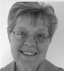
BY CARLA FREED