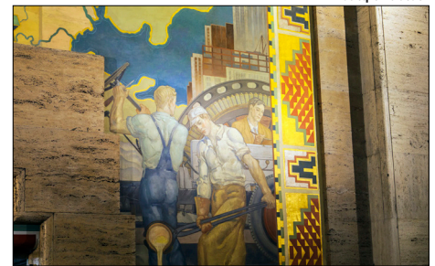
Top: MSURA members at the Detroit Athletic Club; Left Middle: Inside of the Fisher Building; Left Bottom: Inside of the Guardian Building; Top Right: A fashion clothing shop in the Fisher; Above: Mural in the Guardian.

ture in his building design to accomplish this. Many buildings that came after the Guardian Building had similar architecture. It was designated a National Historic Landmark in June 1989.